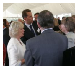
Above: The Duchess of Cornwall meets volunteers from The RBL

Her Royal Highness was also impressed to learn of the success of the 2010 Poppy Appeal in Spain and most interested in examples of the problems Legion beneficiaries experience and how the Legion is able to assist them. Before moving on, the Duchess of Cornwall congratulated the Legion